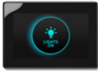
Fresco Touchscreen Controller