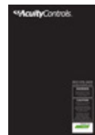
Fresco DXT LPDD